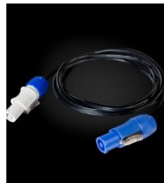
PowerCon connection cables